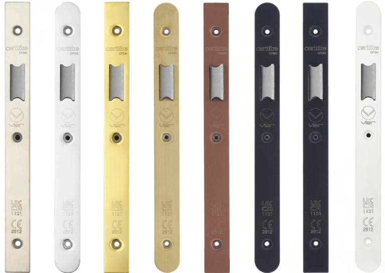
SSS PSS PVDG PVDB PVDBZ PVDBLK PCB PCW