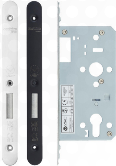
VDL0055-PCB / VDL0055-R-PCB