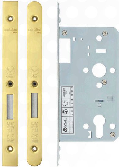
VDL0060-PVDG / VDL0060-R-PVDG