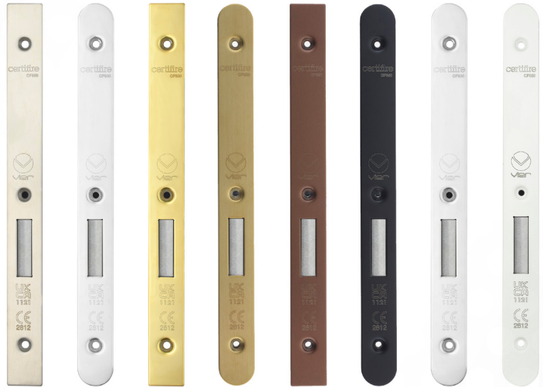
SSS PSS PVDG PVDB PVDBZ PVDBLK PCB PCW