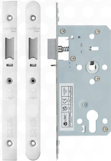
VDL7255-NL-PSS / VDL7255-NL-R-PSS