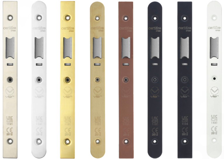
SSS PSS PVDG PVDB PVDBZ PVDBLK PCB PCW