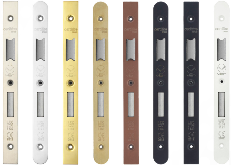
SSS PSS PVDG PVDB PVDBZ PVDBLK PCB PCW