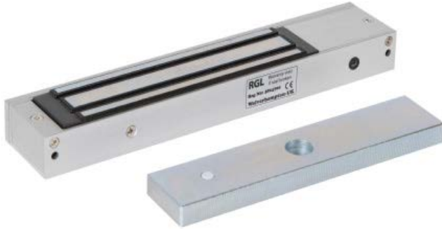
ML600 / ML600-M