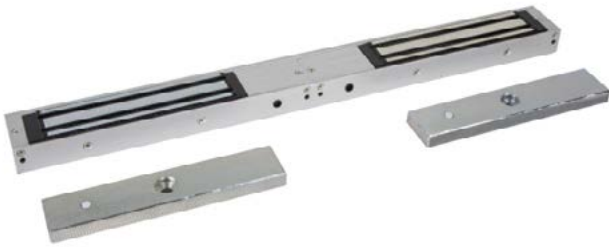
ML600-D / ML600-D-M