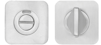
RT004i-S-SSS (Order on request)