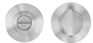
RT004i-SSS (Order on request)